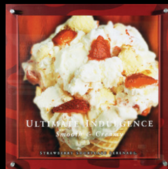
Cold Stone Creamery