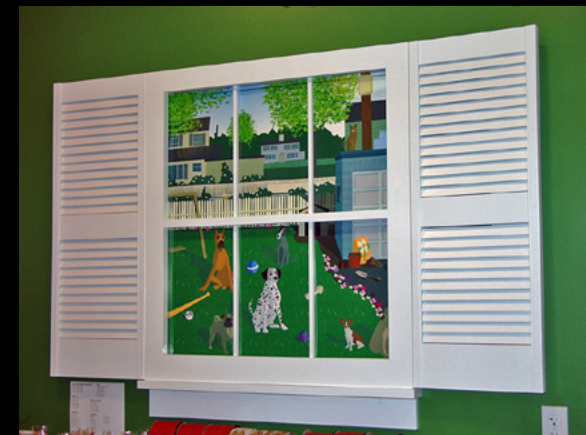
Moochie & Company