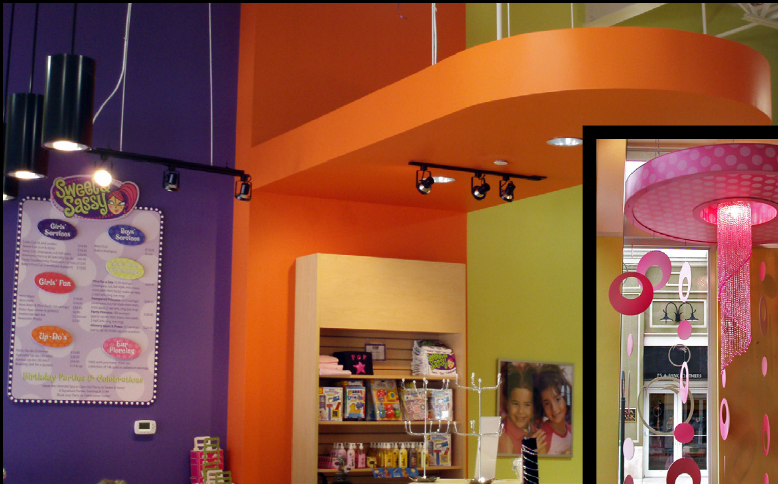
Sweet & Sassy