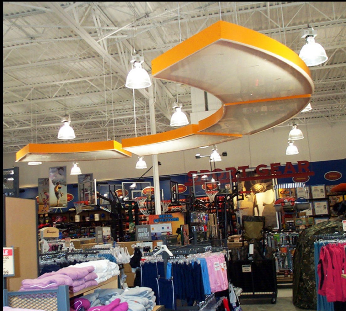
Dick's Sporting Goods