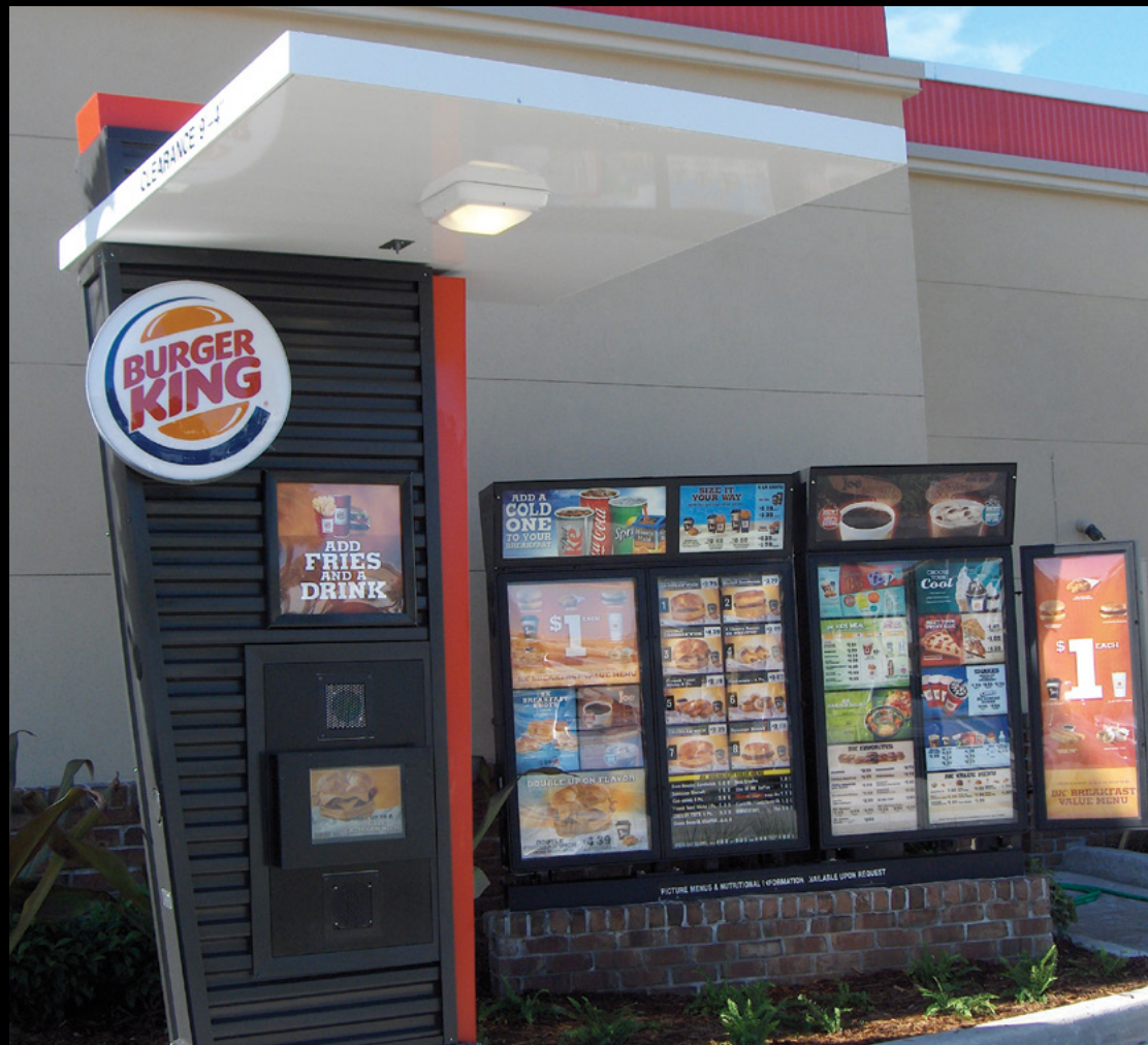
Burger King Drive Thru