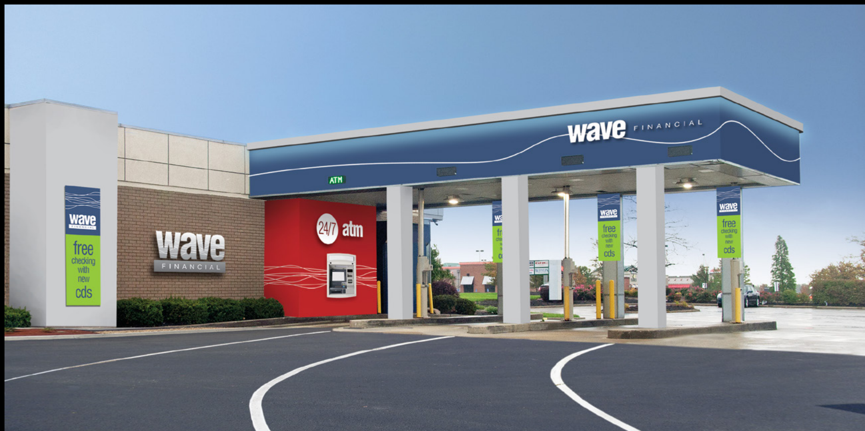
Concept for Banking Exterior