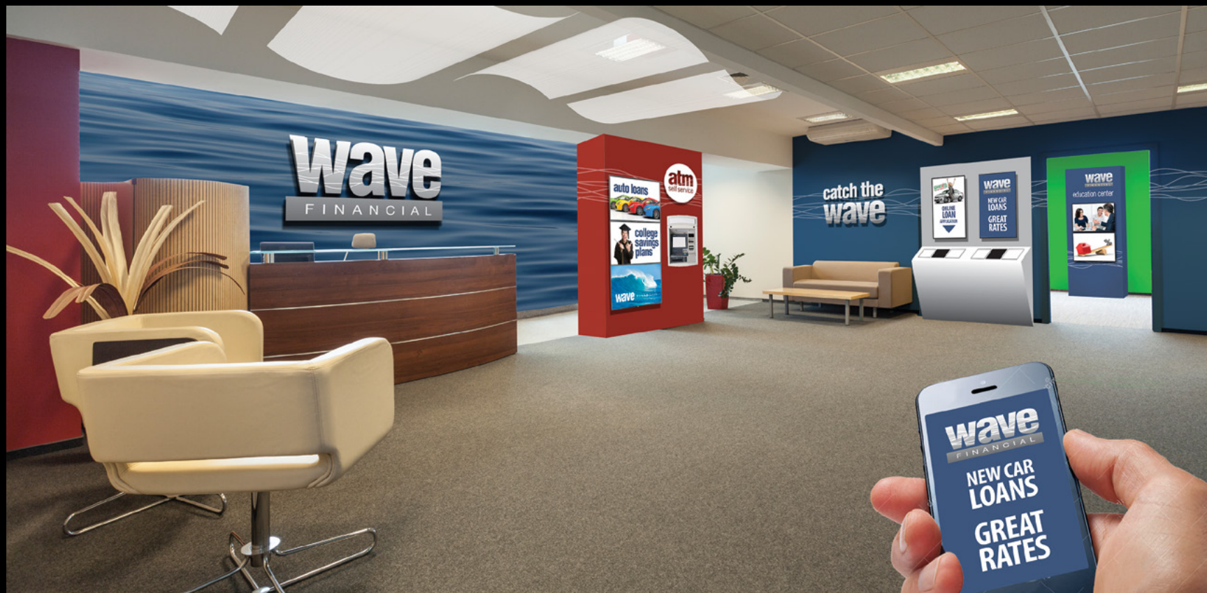
Concept for Banking Interior